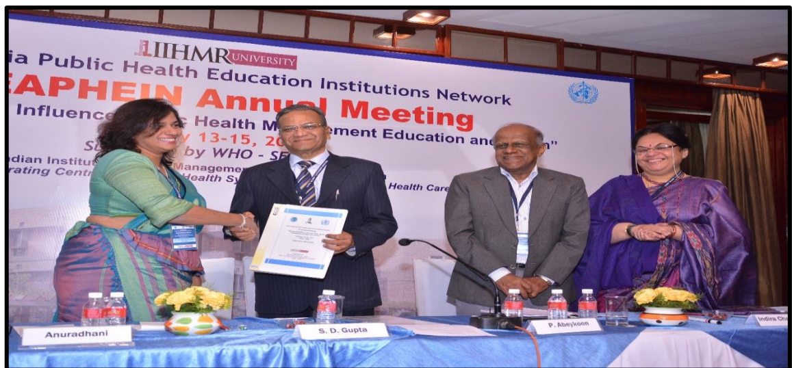
The handing taking over SEAPHEIN President-ship ceremony