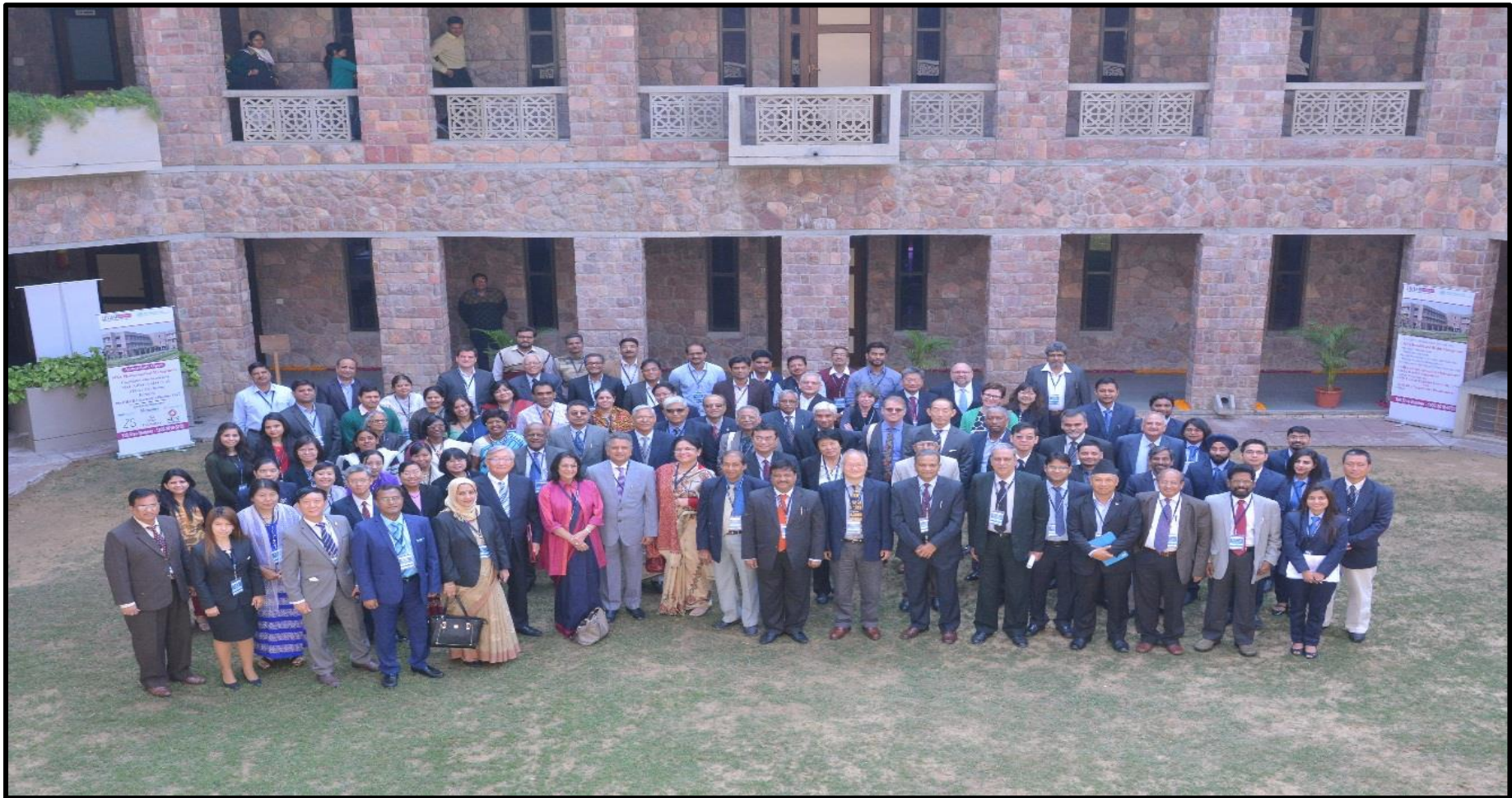
8 th SEAPHEIN Annual Meeting Group Photograph