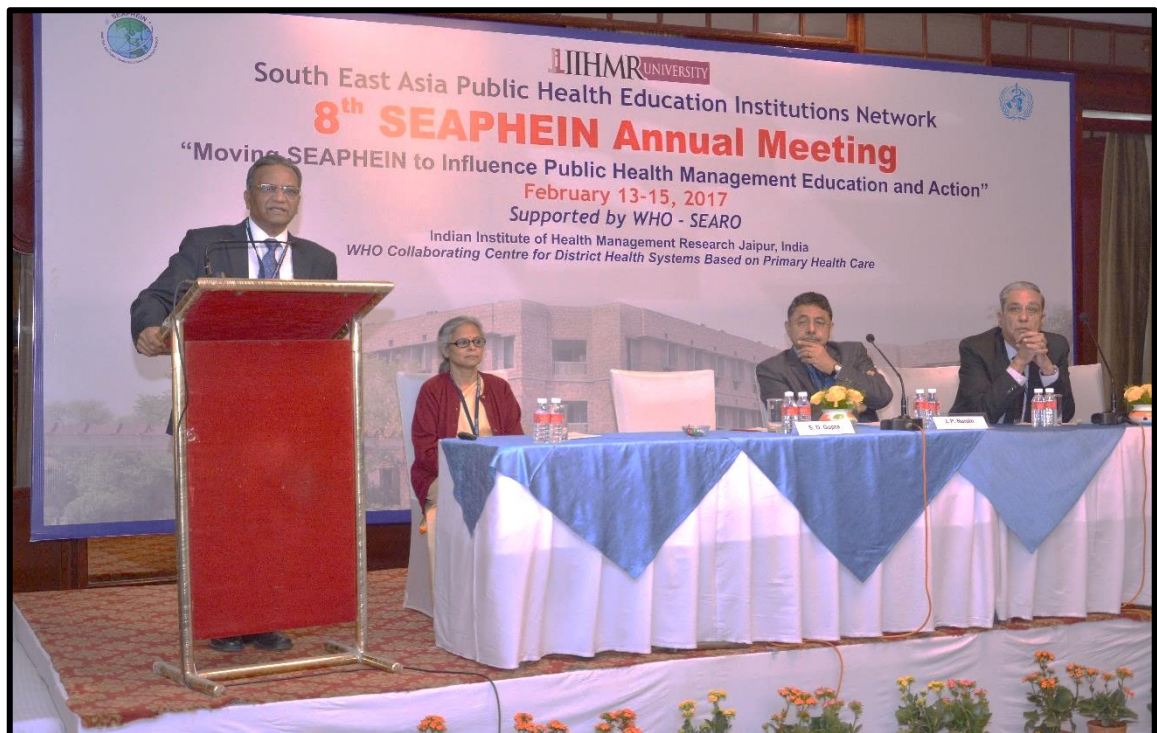
Chair and Presenters conducting the session