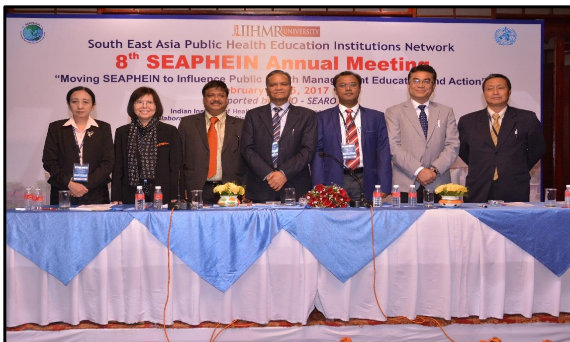
SEAPHEIN Executive Committee Members with President and Member Secretary