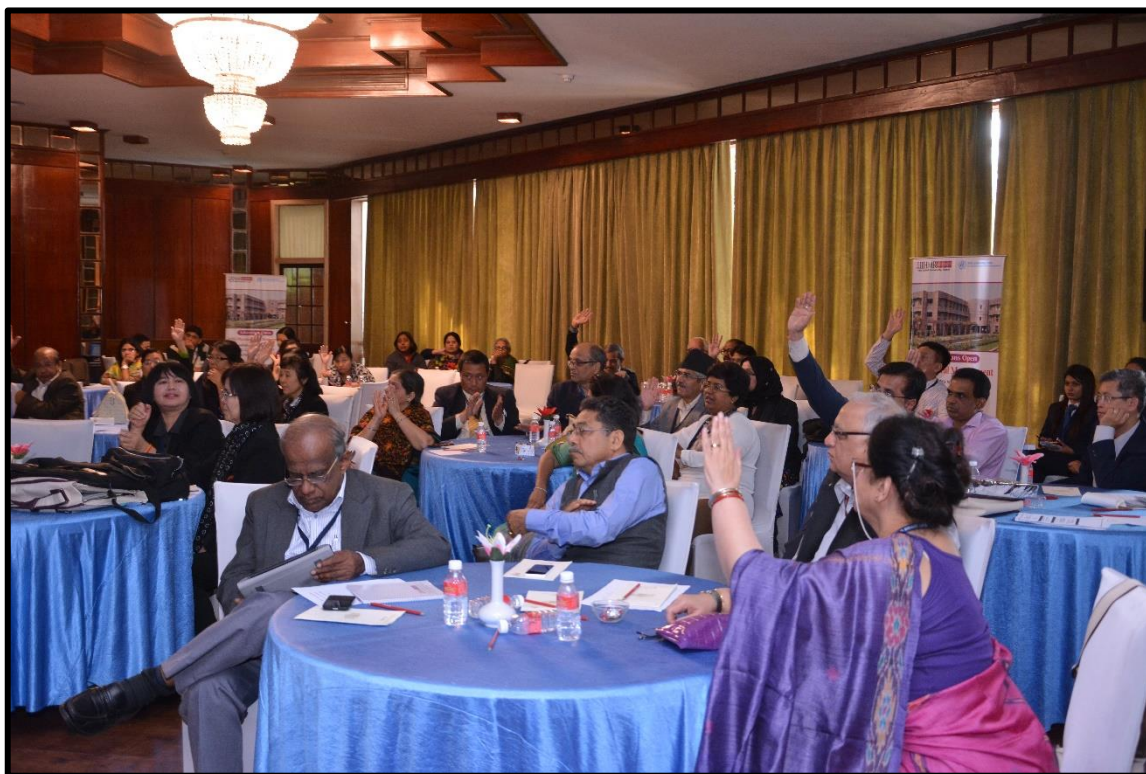
General Body Assembly approved the proposals of the Executive Committee Meeting