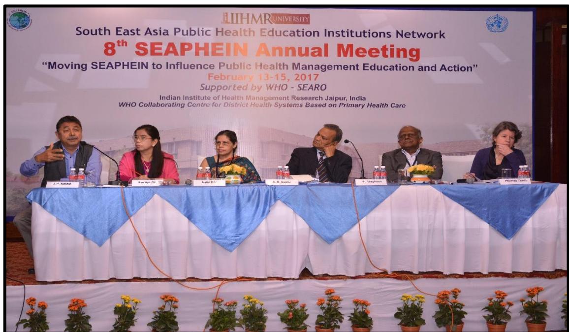
Panelist speaking during the session