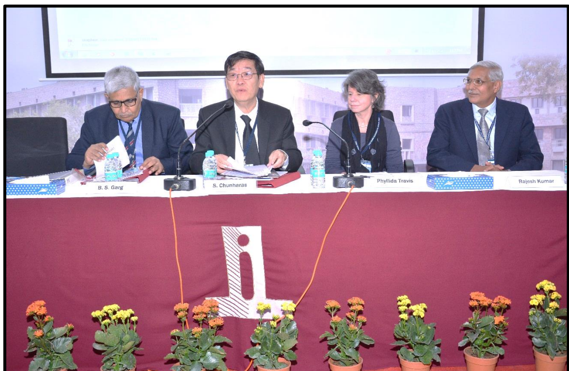
Chair, Co-Chair and Speakers conducting the session