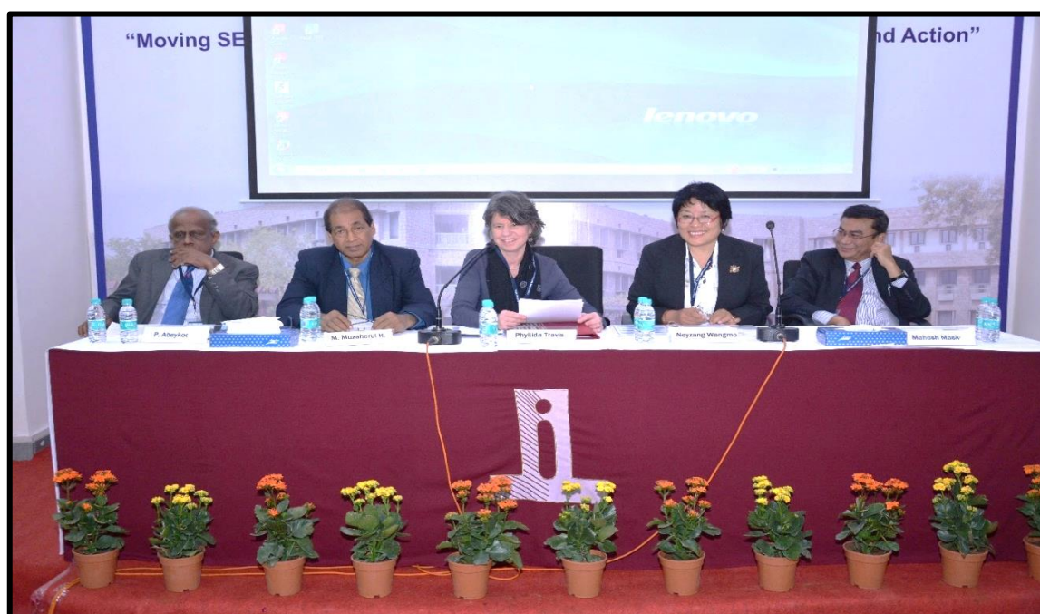
Chair, Co-Chair and Speakers conducting the session