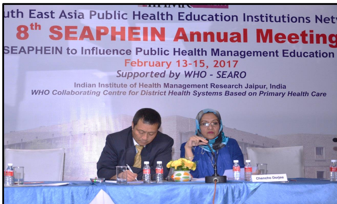
Chair and Co-Chair conducting the session