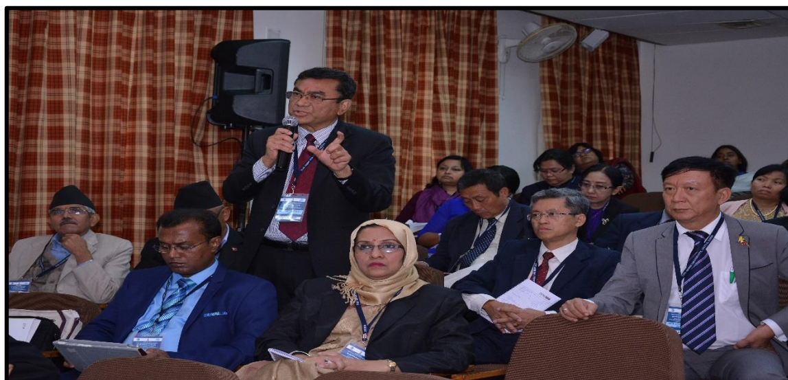
Participants during the session

In the following discussion session, the delegates deliberated on ways to measure equity, needs to reach beyond health sector delivery for building front line workers, revising service delivery models and accurate data to drive health policies in the region. The key to achieving UHC would be a step by step process focusing on quality of care and empowering frontline services. Regarding e Health, the role of private sector would need to be reviewed in detail.