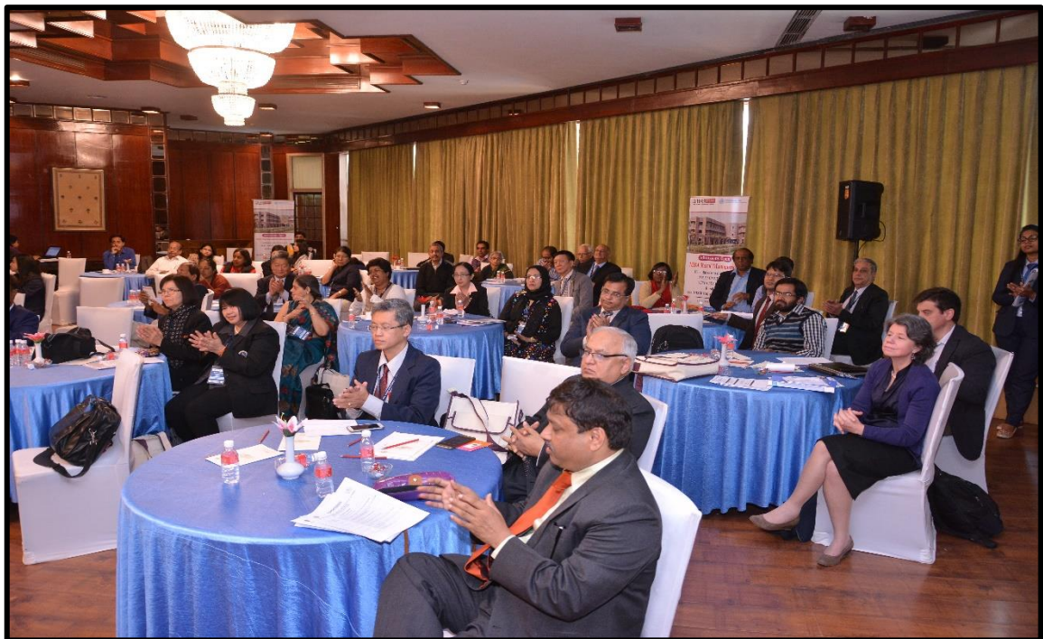
Participants during the meeting

Towards this, it was also important to support an active secretariat. Member countries are very hopeful after this successful meeting; they would become the pall bearers for taking the legacy of SEAPHEIN forward in their own countries and institutions.