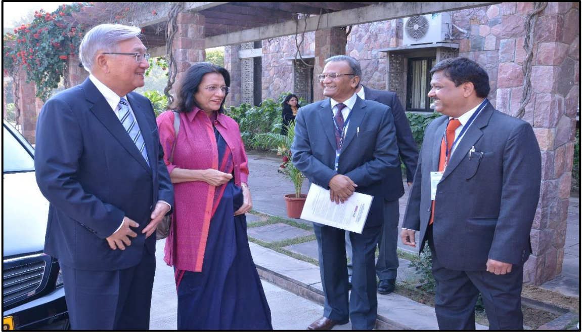
Receiving the Guests at IIHMR