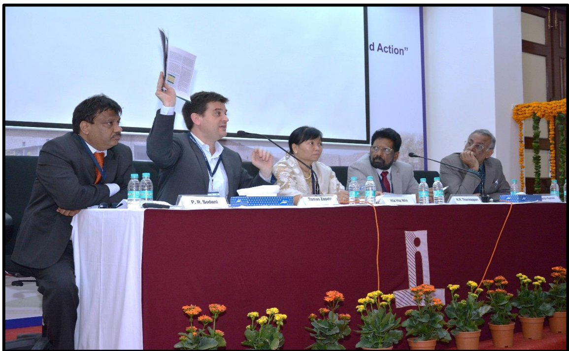
Chair, Co-Chair and Speakers conducting the session