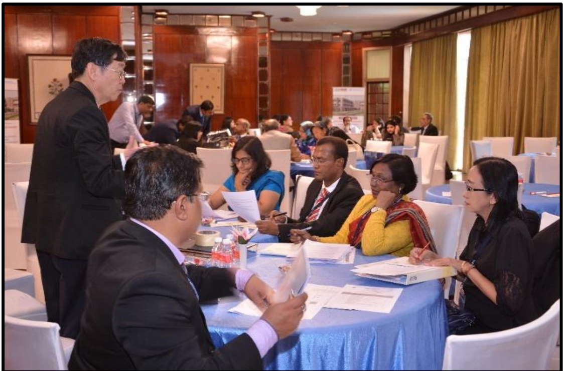
Group work in progress