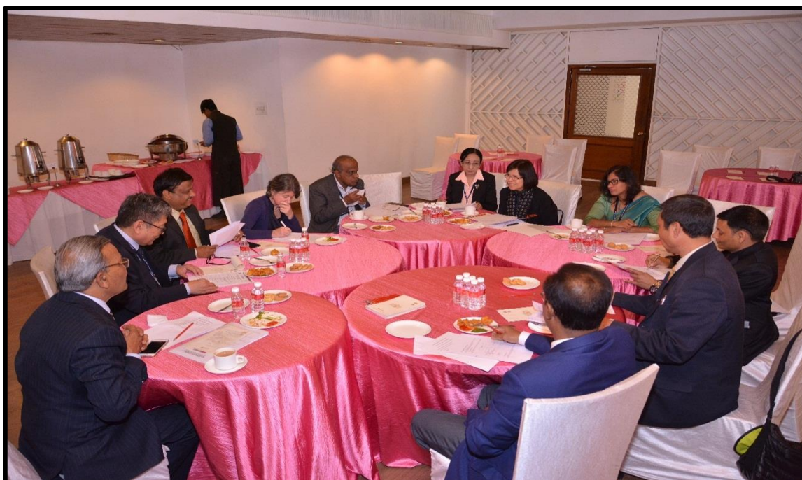
SEAPHEIN Executive Committee Meeting in progress