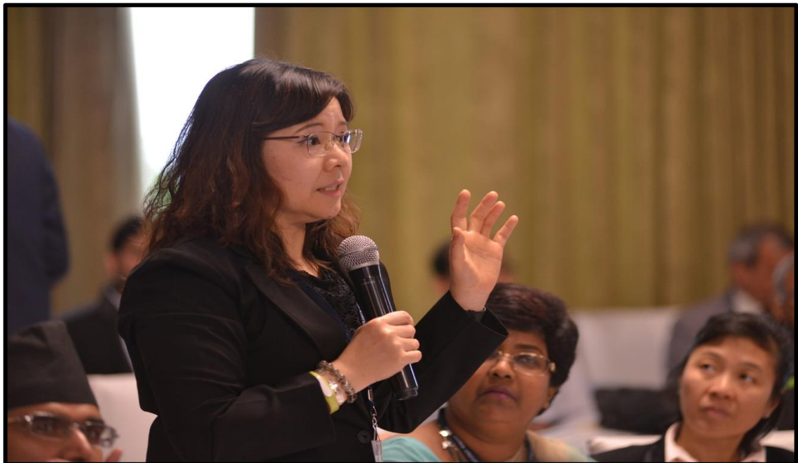
Participant during discussion