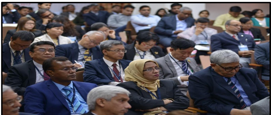
Participants during the session

Dr Huq stressed on achieving access to primary health to meet UHC. Public health workforce was not suitably trained in managing public health needs at primary health care centers due to a lack of practice based education instead of being dependent on a classroom based curriculum approach. Unless public health professionals gained practical experience of ground level program and their needs, they wouldn't be trained in appropriately managing health system after graduating. Faculty awareness on public health challenges at ground level and share learning from NGOs and other sectors directly involved in implementing public health programs was also important. For strengthening learning, new models such as SNAPPS could be explored. Strengthening health system would require need based production of public health professionals from public health institutes. Assessments of needs in health system, requirements in man power, curriculum and evidence based approaches were required to develop a community based health system.